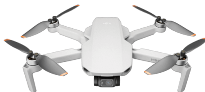
DJI Mini 2