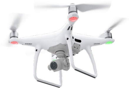
DJI Phantom 4 Pro

For example, the DJI Phantom 4 Pro has a greater dynamic range and more flexibility with video options – meaning that it does a great job distinguishing between shadows and highlights. On the other hand, the smaller size of the DJI Mini 2 makes it far more portable, and it will have greater flexibility in the areas it can operate due to changes in UK legislation.